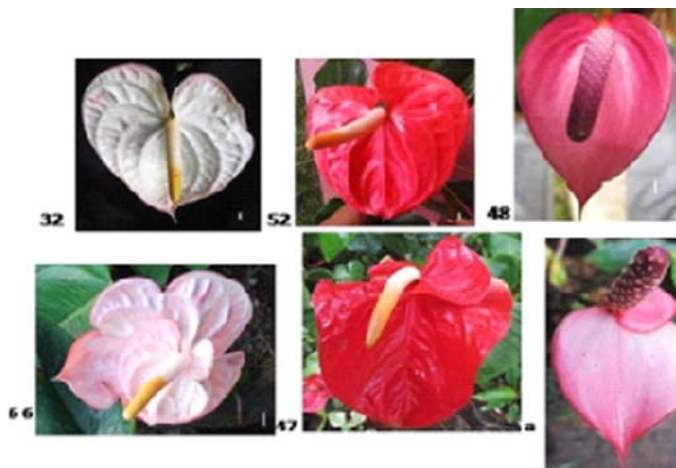
Fig. 3. Naturally occurring spathe variants. Accession 47 and 66-Frequently observed spathe variants: a-The very uniquely observed spathe variant: 32 and 52-Mother genotypes of the variants 66 and 47 respectively.

Several in vitro mutation breeding attempts have been recorded for spathe morphology (Puchoo 2005). According to our survey on anthurium market potential, growers receive a low market value for existing cultivars. In above scenario, natural variants of anthurium spathe would be of importance.